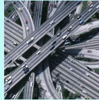
Junctions with underpasses